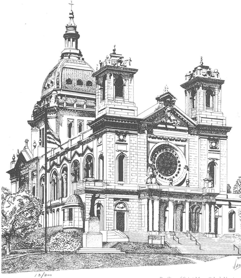
Basilica of Saint Mary